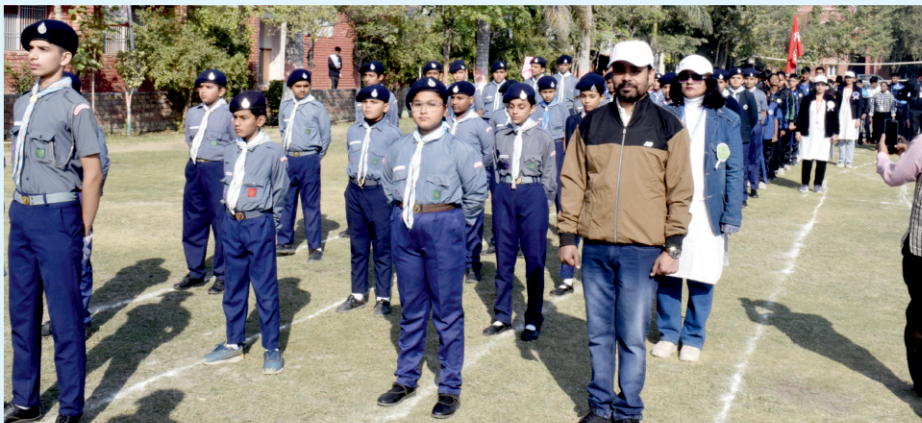
Scouts & Guides ready for drill

N.C.C. Air wing enrolls cadets from Halwasiya Vidya Vihar with an aim of grooming tomorrow's pilots and Air force Officers. The enrolled cadets are given training that includes Parade, Flying, Firing, Technical education and many other disciplines. The performance of the troop has been highly appreciated by high officials from time to time. The N.C.C. troop gives its display at the Republic Day & Independence Day celebrations.