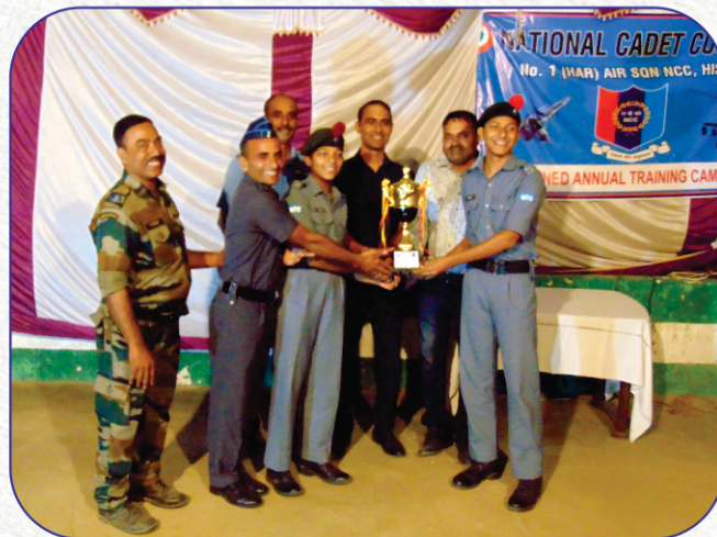
Awarded Drill Square Test Winner Trophy at Annual Training Camp, Tosham

The institution seeks excellence in the sacred field of learning and fulfills a long - felt need to provide modern education to our children with effective emphasis on the eternal moral values enshrined in our hoary tradition and vibrant culture. The appropriate environment for this purpose is ensured in the school campus.