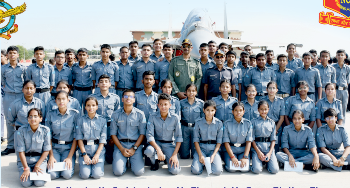
Enthusiastic Cadets during Air Show at Air Force Station, Sirsa

N.C.C. Air wing enrolls cadets from Halwasiya Vidya Vihar with an aim of grooming tomorrow's pilots and Air force Officers. The enrolled cadets are given training that includes Parade, Flying, Firing, Technical education and many other disciplines. The performance of the troop has been highly appreciated by high officials from time to time. The N.C.C. troop gives its display at the Republic Day & Independence Day celebrations.