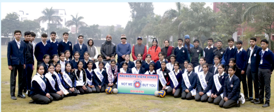
NSS Volunteers with dignitaries in 7 Days Annual Camp