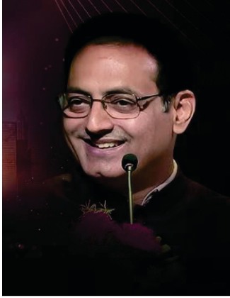
Dr Vikas Divyakirti (Founder and Managing Director of DRISTI IAS)

Career counselling sessions from time to time in the school by the alumni of school who share their professional journey and insights with the students. From entrepreneurs to doctors, engineers to artists, offering valuable perspectives on various fields. Students ask questions, seek advice and gain a deeper understanding of different career options available to them. The alumni emphasizes the importance of one's passion and interests, acquiring relevant skills, and networking within their chosen fields. Their personal anecdotes and practical tips inspire the students to pursue their ambitions with confidence and determination, empowering them to navigate their future career paths.